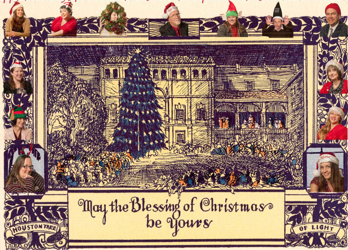
Original 1928 Houston Public Library Card from HMRC's Archives

Happy Holidays from the Houston Metropolitan Research Center 2013