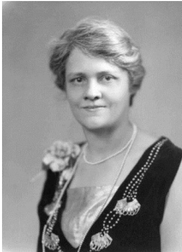
Houston Public Library Friends of the Texas Room