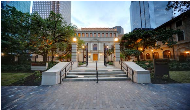
McKinney Entrance to the Julia Ideson Building

Hispanic Heritage Month extended from September 15 th - October 15 th this year. HMRC, as in past years, celebrated this observance through programs, exhibits, tours, and displays that honor the contributions of the Houston's Hispanic community. This year we decided to tie Hispanic Heritage Month activities with the upcoming election in November and to Citizenship Month which is recognized during this same month.